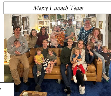
Mercy Launch Team