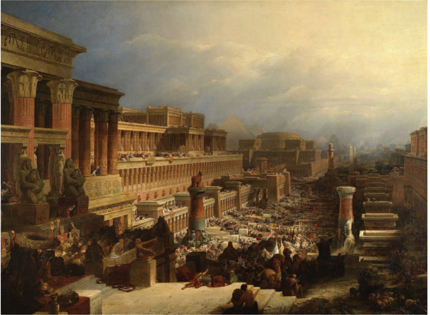
Departure of the Israelites from Egypt by David Roberts 1830